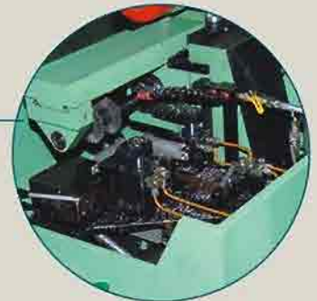
CUSTOM MADE HYDRAULIC FIXTURE