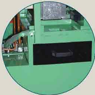
IN-BUILD CHIP COLLECTING TRAY