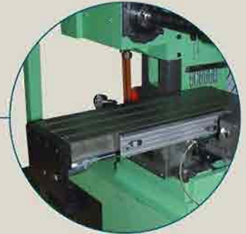
HYDRO FEED SLIDES