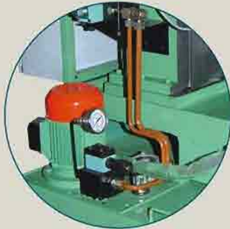
IN-BUILD HYDRAULIC POWER PACK

KMB-MH-250 machine the "X" axis is driven by hydraulic power